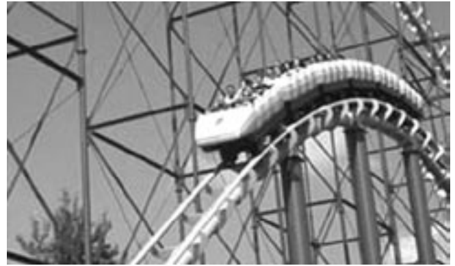
Valleyfair was the exciting surprise destination for 53 of the Sr. High youth.