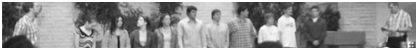
8 Jr. High students were baptized on June 6 th . It doesn't get much better than that! Congratulations students!